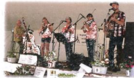
Happy are those who live in your house, ever singing your praise. Psalm 84:4